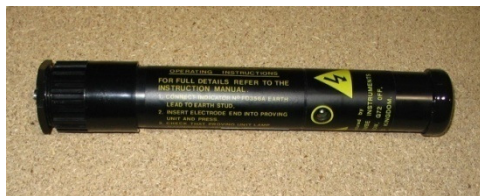
HVI Proving Unit

Range: 0.2 to 15kV 50/60HZ and DC Circuit Current: 0.4mA nominal at 15kV 0.293mA nominal at 11kV Dielectric Test: 20kV for 1 minute Length: 485mm Diameter: 32mm Weight: 0.6kg