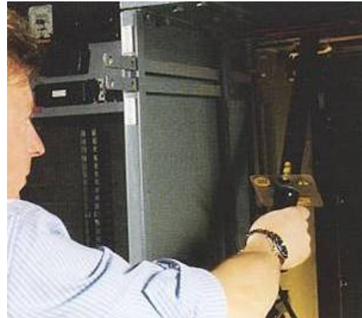
HVI - Switchgear Testing