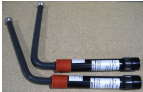
Bent End Adaptors

Output Voltage: 300V DC nominal Batteries: 2 off C cells, IEC R14 or LR14 Battery Low: 2V DC nominal Length: 255mm Diameter: 37mm Weight: 0.4kg