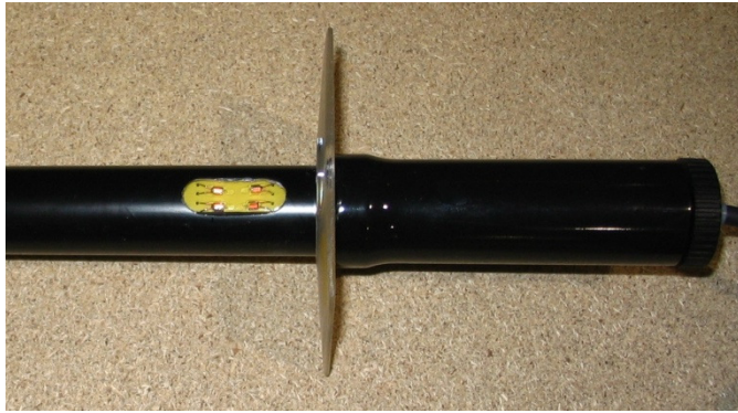
Indicator Neon Operation