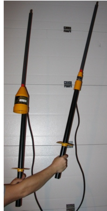
Special LLI with handles for Rail Networks Operation